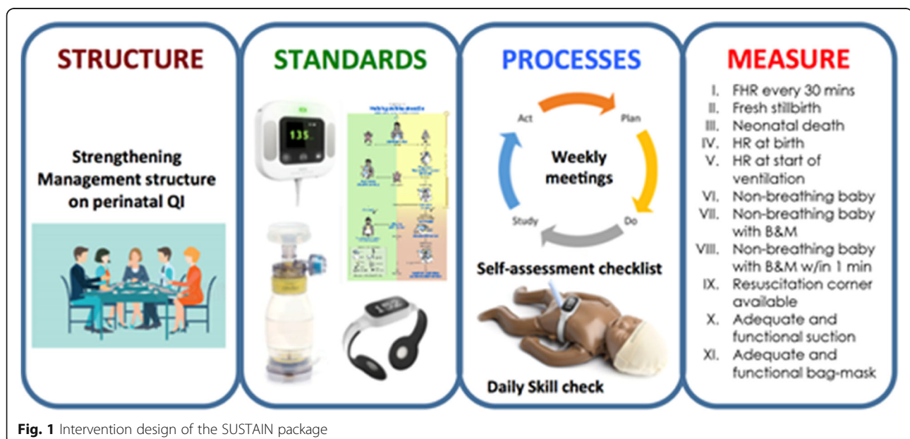
Fig. 1 Intervention design of the SUSTAIN package