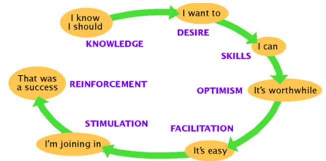
Figure 2 Sequential model of behavioral and social change. Source: Robinson, L, "The Seven Doors Social Marketing Approach," 1998. https://www.comminit.com/en/node/201090 Accessed 16 September 2009.

The next step, facilitation , helps convince the audience that it is feasible, even easy, to adopt the new behavior. Social modeling is one mechanism for achieving this goal [35,36]. Social models are individuals similar to the audience who model successful execution of the new behavior. When individuals view those who are similar executing a behavior, it enhances their self-efficacy (i.e., confidence) for performing that behavior themselves. And high self-efficacy increases the likelihood that the target individuals also will execute the behavior [35,36]. Thus, for example, meeting peers who have successfully completed depres-